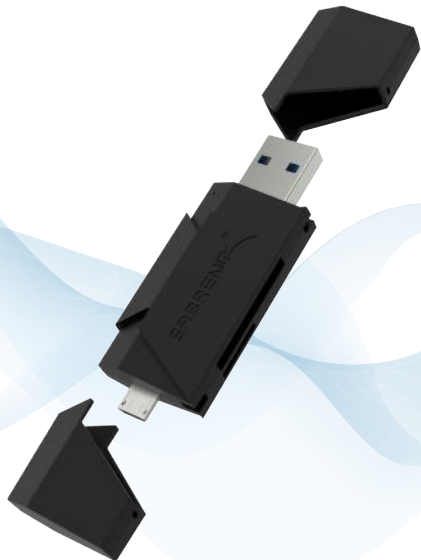
Sabrent 2-Slot Micro USB OTG and USB 3.0 Flash Memory Card Reader